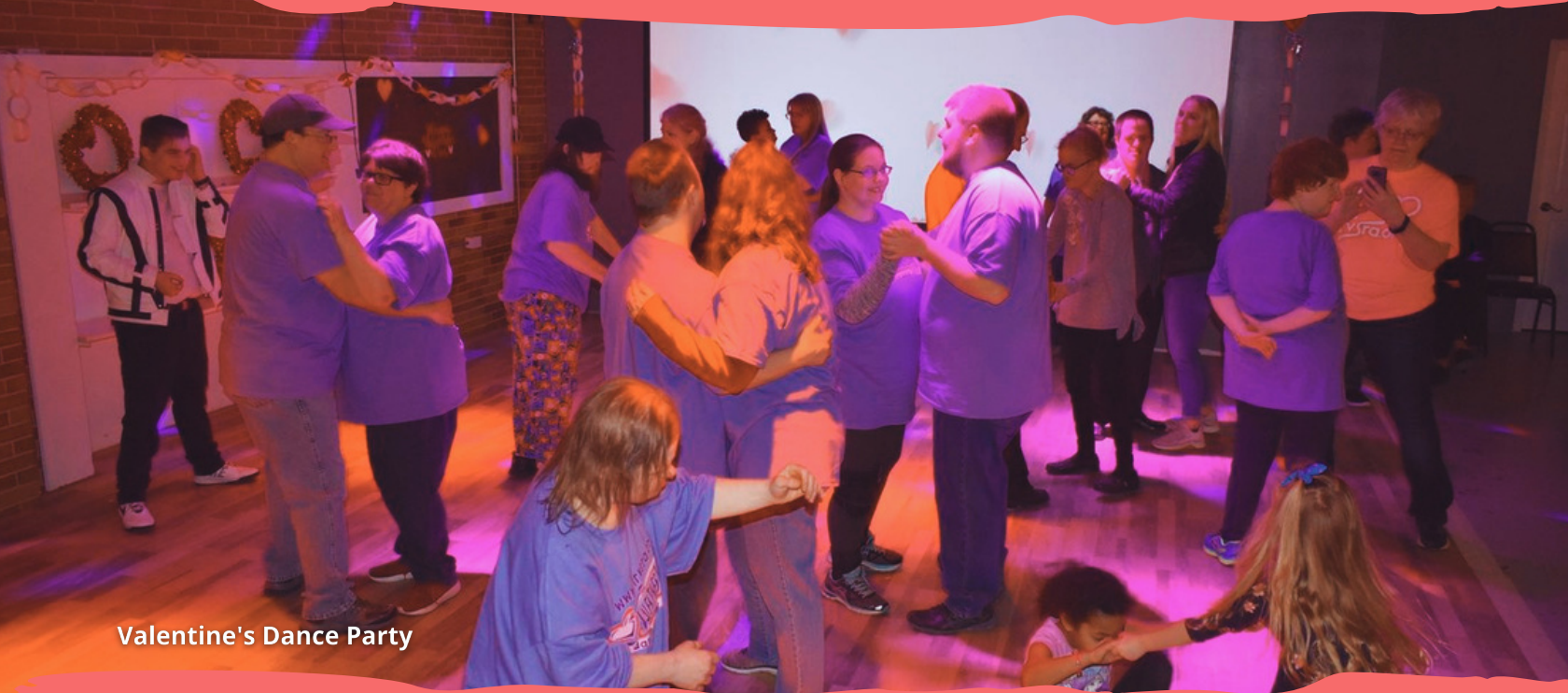
Valentine's Dance Party

PRSR STD US Postage PAID Peoria, IL Permit # 793