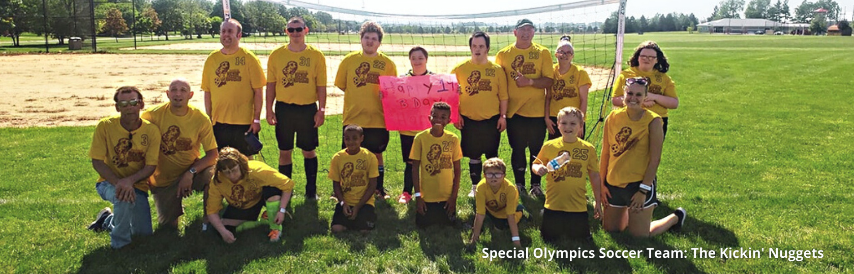
Special Olympics Soccer Team: The Kickin' Nuggets